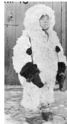
N-1979-004: 0088