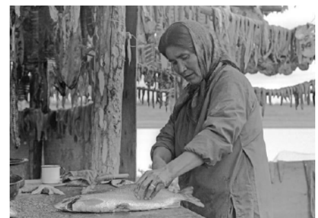
N-1987-017: 0285